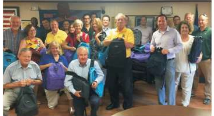
(L-R) Lots of Rotarians, friends, and family

The Rotary Club of Media "After Hours" meeting held at the Media VFW Post was more than just glad-handing and adult beverages. The VFW hall filled with Rotarians and friends who put together 50 backpacks with supplies for children in need in our area.