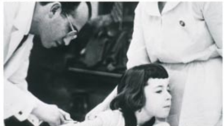
Dr. Jonas Salk with one of the first children to receive the vaccine.

April 2015, marks 60 years since the Salk polio vaccine was declared safe, effective, and potent. In that time, the number of polio cases has dropped by 99 percent worldwide. With just three countries remaining polio-endemic, we are closer than ever to eradicating this crippling disease.