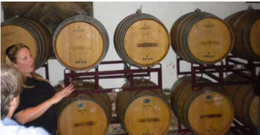
A good time was had by all!