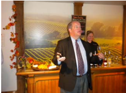
Our Hostess led us through an instructive flight of wines: 3 whites ranging from dry to fruity followed by a merlot, a cabernet and ending with an Apple spice dessert wine which was warmed to help ward off the chill night air.