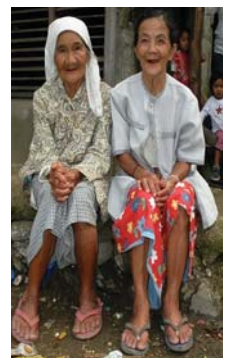
Vets of the Field

Although my language may depict the Ifugao people as ancient, fire-ritual tribesmen, don't be deceived. They're sociable, pleasant and warmhearted. They wear the same clothes as us, they eat with plates and silverware, they read novels. The children go to school and play basketball and tag. On weekends, many help their parents tend to the fields. Yes, many aspects of their lives are worlds from ours. But while I won't profess that there is---or should be---any sense of a "normal" person, I can tell you that the Ifugao people, despite thousands of generations of isolation, are remarkably similar to you and me. And each person I met yet