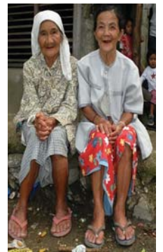
Vets of the Field

Although my language may depict the Ifugao people as ancient, fire-ritual tribesmen, don't be deceived. They're sociable, pleasant and warmhearted. They wear the same clothes as us, they eat with plates and silverware, they read novels. The children go to school and play basketball and tag. On weekends, many help their parents tend to the fields. Yes, many aspects of their lives are worlds from ours. But while I won't profess that there is---or should be---any sense of a "normal" person, I can tell you that the Ifugao people, despite thousands of generations of isolation, are remarkably similar to you and me. And each person I met yet