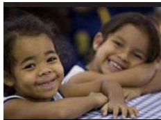
Children, recipients of a Rotary Foundation Matching Grant to correct heart irregularities, are all smiles at the Padre Francisco Da Motta school in Brazil. In December, the Foundation approved the 30,000th Matching Grant.

More than 20 children in India will congenital heart defects will soon benefit from the 30,000th