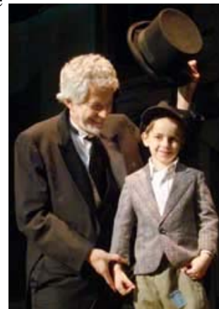
Approximately 8,000 people viewed this show this past holiday season.

Hedrow, formed in 1890, performed Charles Dickens 1893 story of "A Christmas Carol" for six weeks, totaling 62 shows.